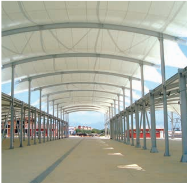
ORGANIC MARKETPLACE Didim / TURKEY

Didim Organic Marketplace offers locally grown fresh products for their visitor. You can enjoy and feel the comfort shopping under our perfectly designed sun shades.