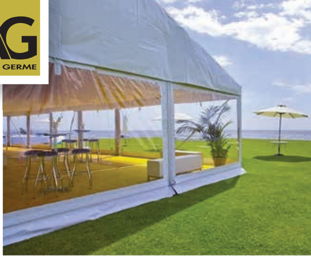
EVENT TENT Casablanca / Morocco Our Neo Series 20m tent sold and build in Casablanca. Our tents serves as a event venue not only in Casa- blanca but also in many countries.