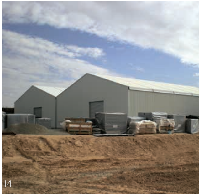
INDUSTRIAL WAREHOUSES Tripoli / Libya 1200m² relocatable aluminum framed warehouses build in Tripoli. PVC membrane roof covers provide natural lighting for better work envi- ronments.