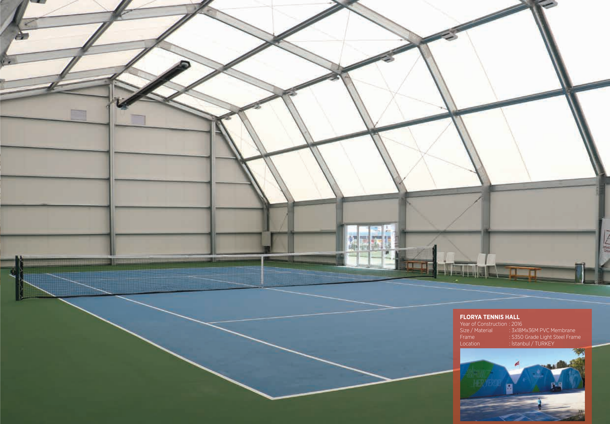
FLORYA TENNIS HALL Year of Construction : 2016 Size / Material : 3x18Mx36M PVC Membrane Frame : S350 Grade Light Steel Frame Location : Istanbul / TURKEY