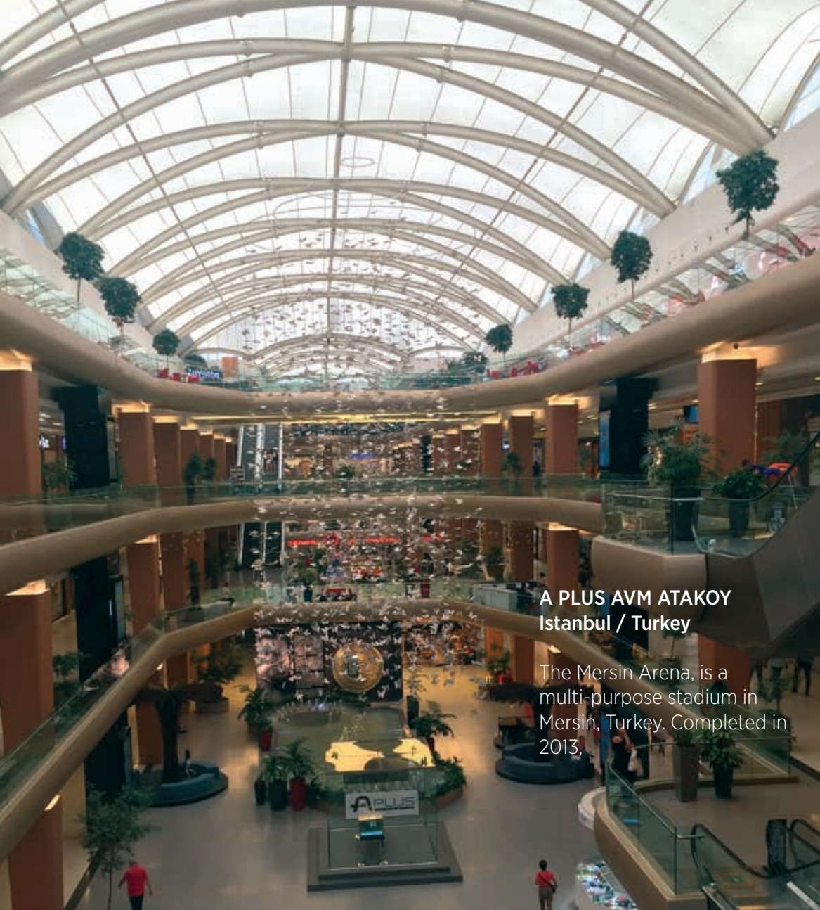
A PLUS AVM ATAKOY Istanbul / Turkey

Atakoy Shopping Mall with its giant membrane dome brings the sun in and gives their visitors the percept harmony of indoor comfort and outdoor airiness.