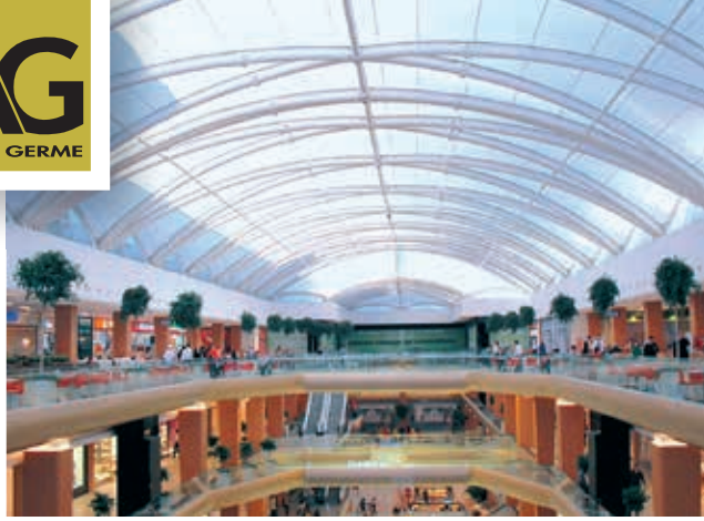
Atakoy Shopping Mall Istanbul / Turkey

Atakoy Shopping Mall with its giant membrane dome brings the sun in and gives their visitors the percept harmony of indoor comfort and outdoor airiness.